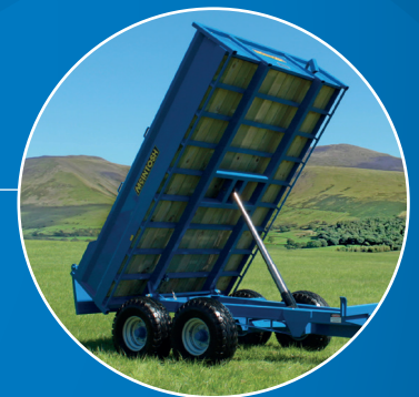
Single rams on all trailers for better stability on hills